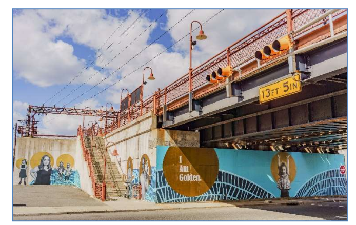
Newark, New Jersey