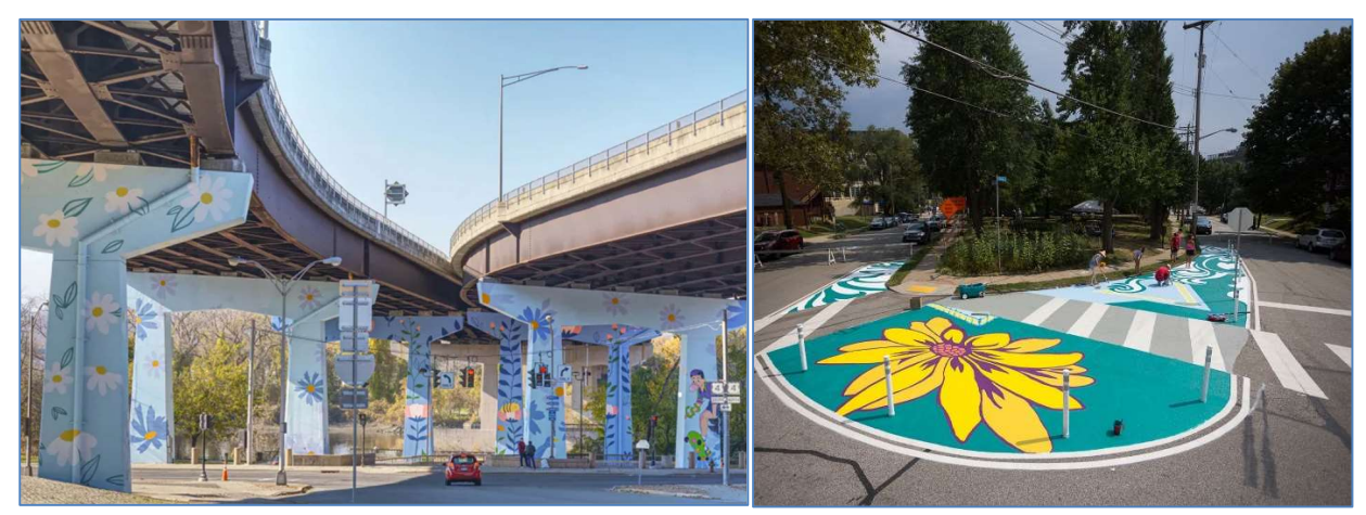
Troy, New York

The images below provide some precedent imagery from projects around the country that BUDC has taken note of.