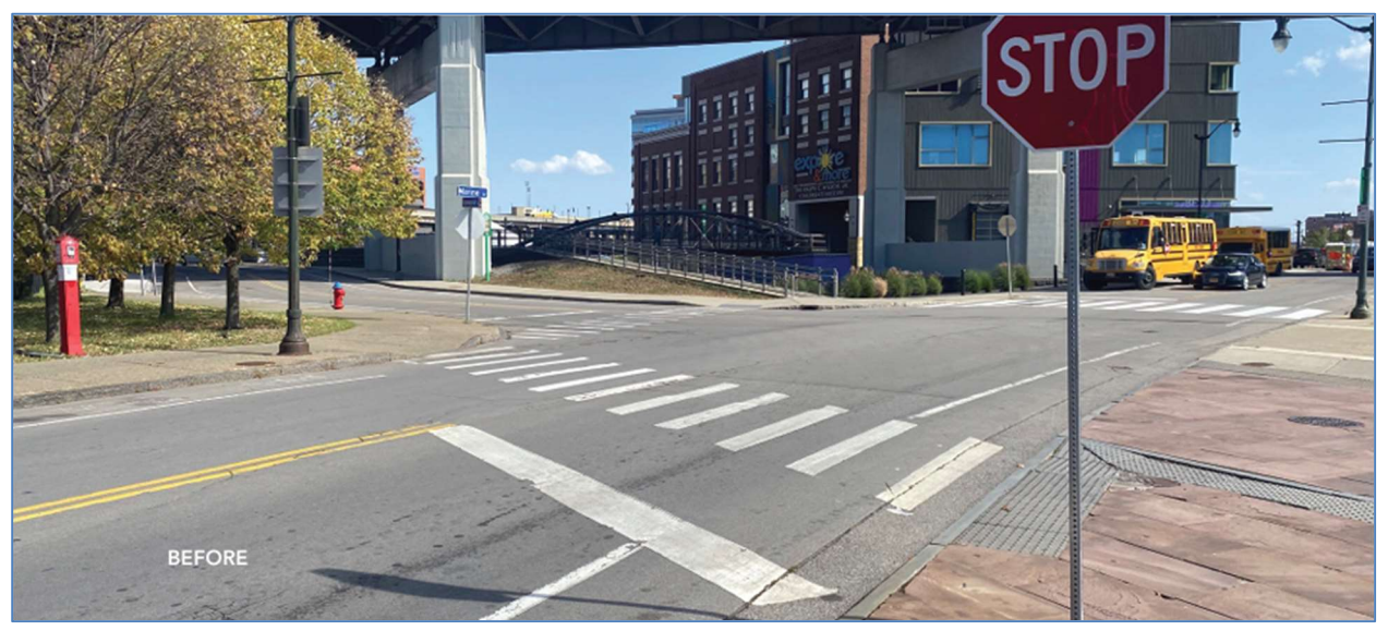
The intersection of Marine Drive and Commercial Street at Canalside

The Buffalo Urban Development Corporation (BUDC) is requesting proposals from experienced design, planning, and engineering firms for the temporary redesign of the intersection at Commercial Street and Marine Drive, and the surrounding area ( see Exhibit 1 on page 14 ). BUDC seeks a firm, or team, that is positioned to undertake the design, planning and implementation phases necessary to complete this project. This intersection is a major gateway to Buffalo's Canalside District. Currently, the intersection poses significant safety challenges that need to be addressed promptly and effectively. As several key construction projects are underway in the immediate vicinity, BUDC envisions improvements to this intersection through temporary low-cost interventions that incorporate public art (asphalt and/or concrete murals) and improved walkability, wayfinding and traffic calming. BUDC envisions that collectively, these types of interventions will culminate in an improved sense of place. BUDC intends for this project to help residents and visitors navigate Buffalo's waterfront more safely and to enhance the waterfront's sense of place as several major construction projects take place in the vicinity. Buffalo's "Canalside" welcomes over 2million visitors annually.